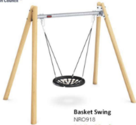
Basket Swing NRO918 1.14kg CO 2 e/kg 6.8% Recycled content

Sway Jubilee Recreation Ground Junior Play Area