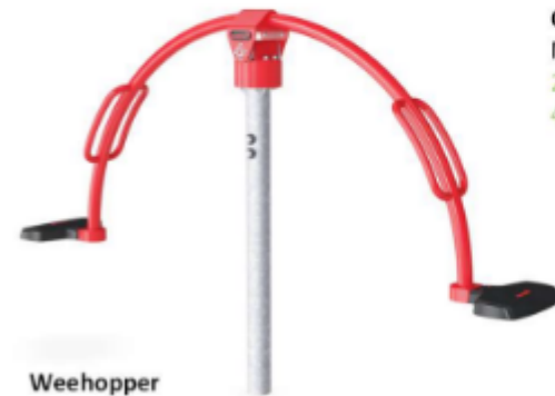
Weehopper PCM159 2.83 kg CO 2 e/kg 44.1% Recycled content